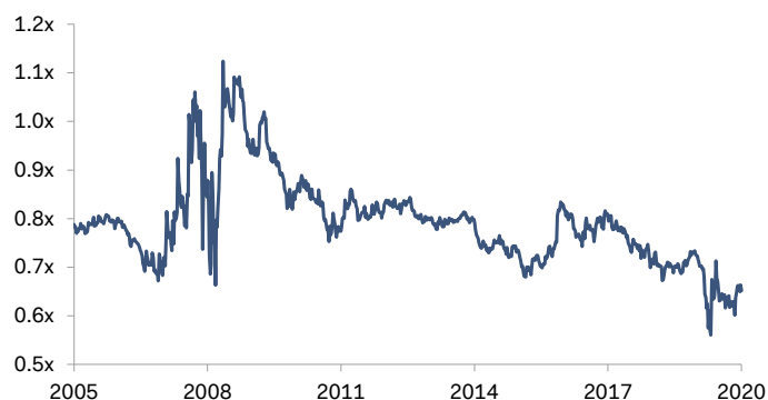
Figure 2: The U.S. Financials Sector Is Trading Near Its Lowest Relative P/E Ratio